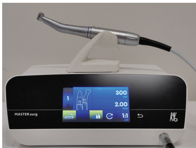
Fig. 2 The instrumentation adopted for the study: motor and handpiece.

with 3 mL of 5% sodium hypochlorite using disposable 28 G needle and plastic syringe. No lubricant paste was used.